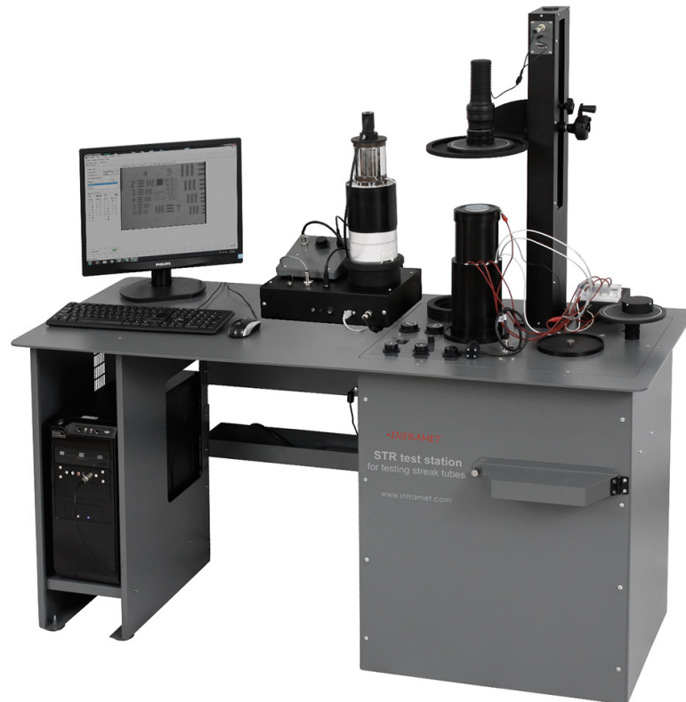
Fig. 1. Photo of STR test station