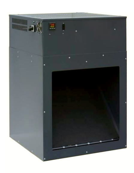
Fig.1. Block diagram and photo of the ULAB blackbody

CONCEPT. The ULAB is a medium temperature blackbody of ultra large active emitter area. The blackbody was designed for applications where ultra large sources of infrared radiation are needed. The ULAB blackbody was designed using an unique solution based on an concept of horizontal blackbody and large reflective mirror. Due to use of this concept blackbody is characterized by very good thermal uniformity if we consider its large area. At the same time the emitter of blackbody is protected from air fluctuations. Therefore the ULAB blackbody is characterized by excellent temperature stability even when used at outdoor conditions when blackbody is exposed to some wind.