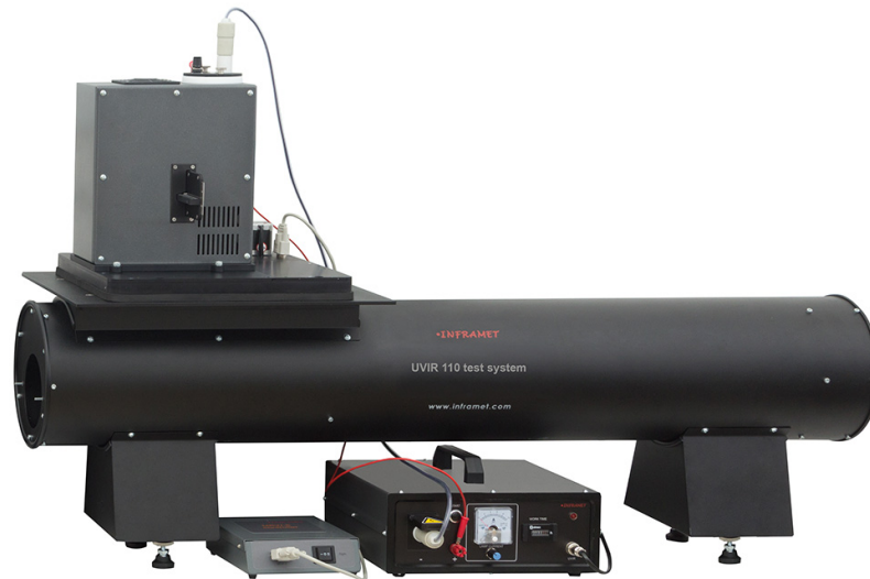
Fig. 2. Photo of UVIR test system